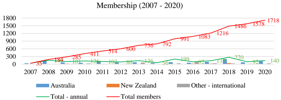
Fig. 1 The skin cancer CRN membership growth

Strategies to grow the skin cancer CRN membership were applied and the results include the following: